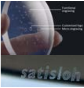
Functional engravings and branding.