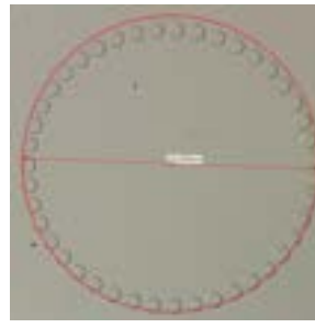
1,6 mm circle formed by 60 µm dots.