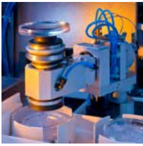
Automated, fast and precise lens loading